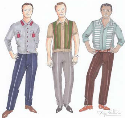
Costumes for men in the office scenes, circa 1960