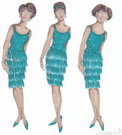
Back up singer costumes, circa 1963