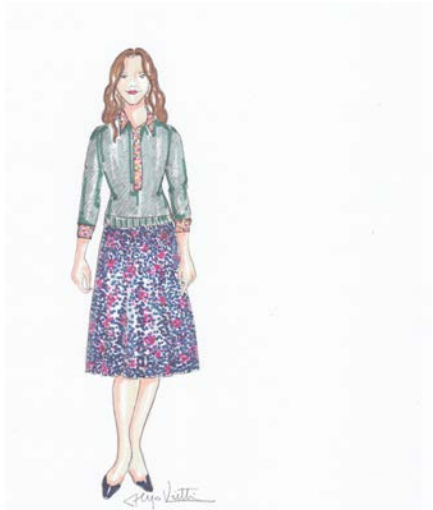
One of Carole King's costumes, circa 1968