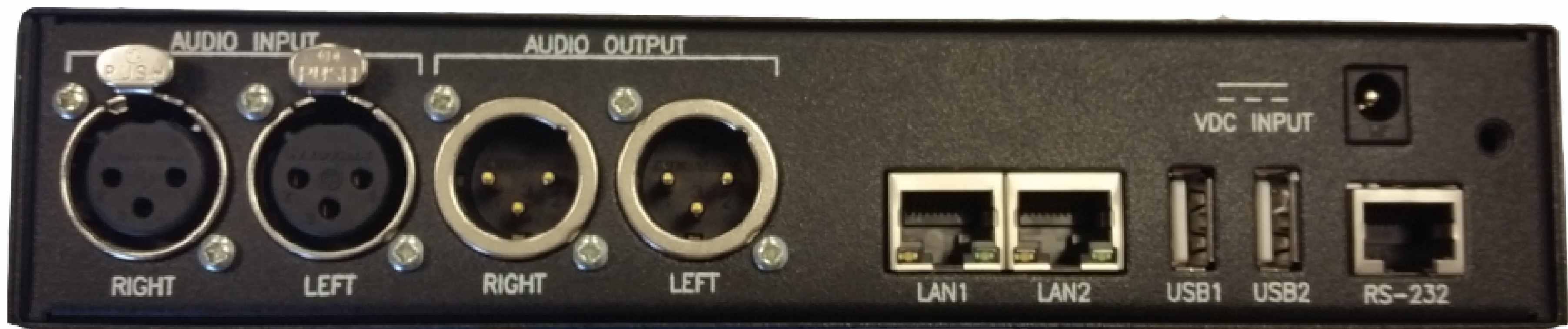
QLST. Rear View