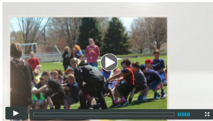
Field Day 2016

Special Thanks to the Field Day Team and all the parent volunteers for a fabulous day at Alter High school last week. Students in grades 3-6 participated in numerous activities. Check out the video of a few photos that were taken that day.