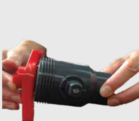
Handle Acts as a Key