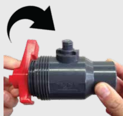
Clockwise to Tighten