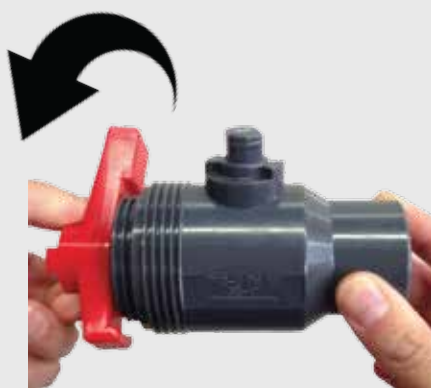
Counter - Clockwise to Loosen