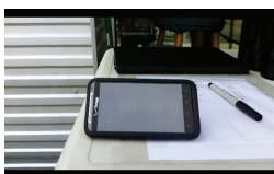
Set it up