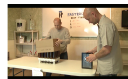
Put a Beer Box on it