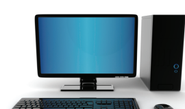
Send us the Videos!

Sign up today at: http://www.fastbrewing.com/node/add/fastrack-speed-challenge-event or Email: Jes@TheFastRack.ca