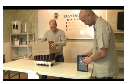
Put a Box on It