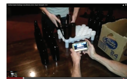
Fill the FastRack